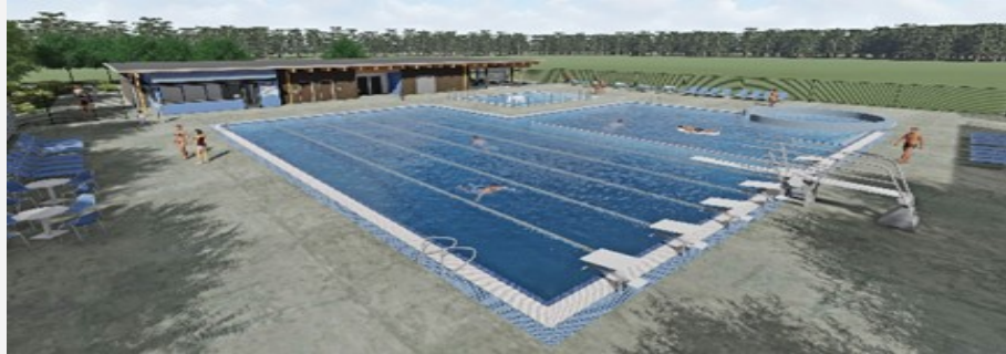
ARC Architects Pool Rendering

The City and ARC Architects have begun reviewing the Design Development phase of the Community Center design as we prepare to get into the Construction Documents phase of the Community Center portion of the project. We anticipate having a community meeting in the coming month or two, and we encourage you to participate as we set a date and time for the community meeting.