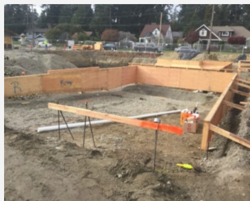
Forms for the new wading pool looking west.