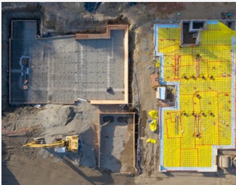
Aerial photo of the pool and bathhouse site taken 11/3/19 by Joe Barrentine.