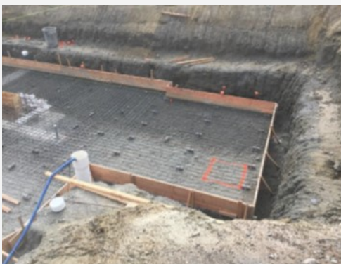
Rebar and forms for the lap side deep end of the pool.