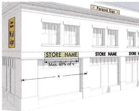
27 28 Figure 26

16 (1) Wall signs shall be proportional and shaped to the architectural features of the 17 buildings. Signage shall not exceed 60 percent of the width of the wall plane upon 18 which the sign is placed or the width of the tenant space, per Figure 26. Signage 19 shall not exceed 70 percent of the height of the blank wall space or fascia on 20 which the sign is located. These standards also apply to upper level tenant space.