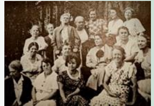
Fircrest Garden Club 1935

In May 1937, a local non-profit organization, the Fircrest Recreation Association, was established. The group played an active role in promoting recreational, social, and community activities, particularly those geared toward the town's youth.