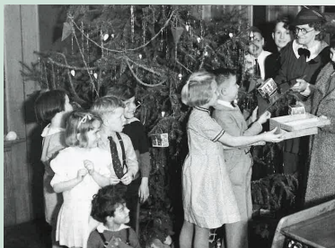
Toys Made in Fircrest 1936

In May 1937, a local non-profit organization, the Fircrest Recreation Association, was established. The group played an active role in promoting recreational, social, and community activities, particularly those geared toward the town's youth.